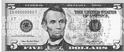
Five Dollar Bill