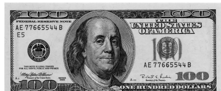
One Hundred Dollar Bill