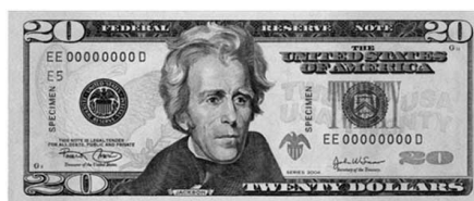
Twenty Dollar Bill