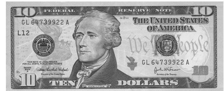
Ten Dollar Bill