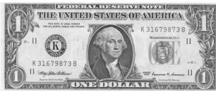
One Dollar Bill

Part B: Can you name the presidents or famous Americans on the bills below? Hint: Some of them are also on the coins you just learned about! Write your answers on the lines provided.