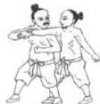
USHIRO EMPI UCHI