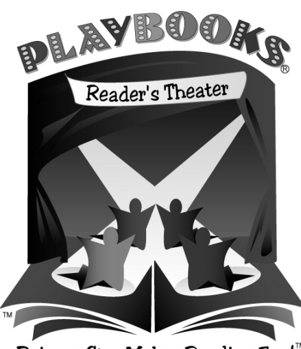
Being a Star Makes Reading Funl<sup>m</sup>