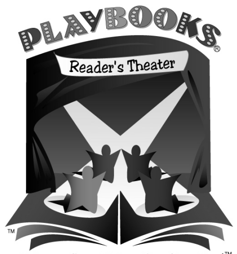
Being a Star Makes Reading Fun!™